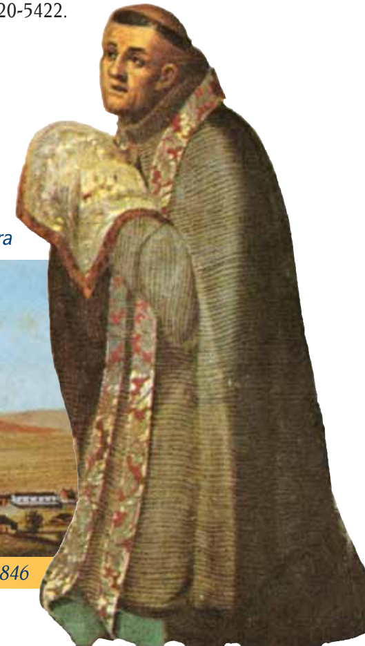
Father Junípero Serra