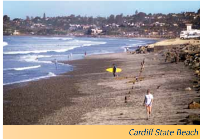
Cardiff State Beach

The park has 220 campsites and two day-use areas. Ponto Day-Use Area, south of the campground, has restroom