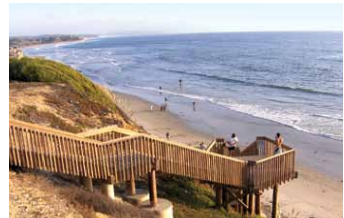
San Elijo State Beach

San Elijo State Beach, with two miles of coastline, is mainly a campground, but