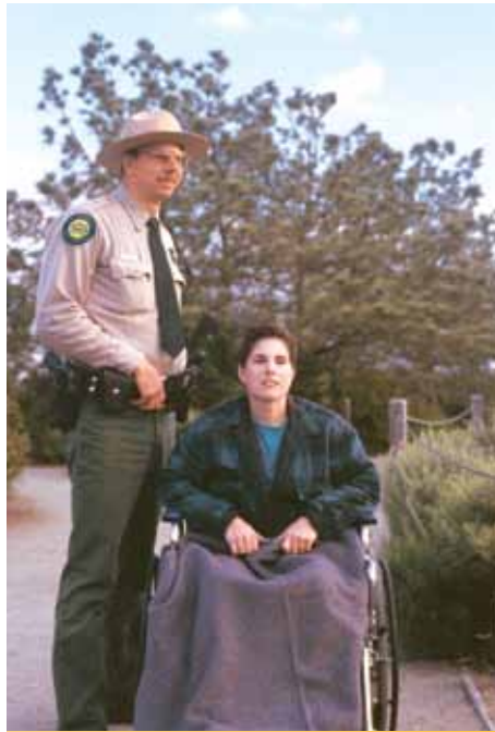
Torrey Pines State Natural Reserve

Torrey Pines State Natural Reserve is a jewel of the California State Park System. Named for the native pines growing on the bluffs, this park has natural splendor that is truly memorable. Seven miles of hiking trails offer