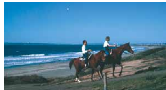
Border Field State Park