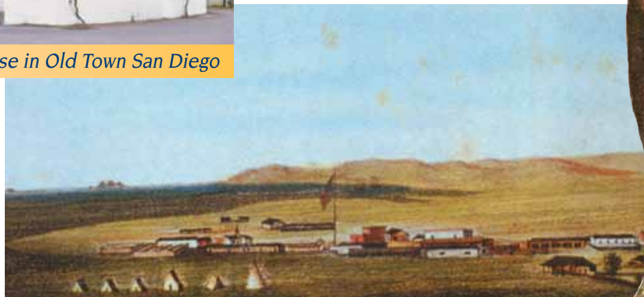
Painting of early San Diego by Lt. William H. Emory, 1846