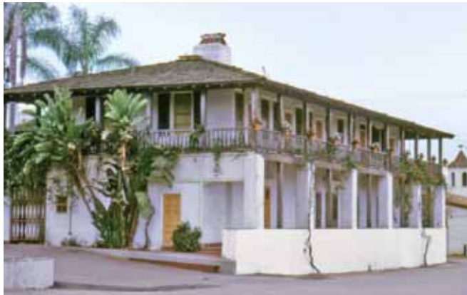
Bandini House in Old Town San Diego

Today the historic park reflects the cultural elements of its exciting and romantic past. Guided tours are available. For more information, call (619) 220-5422.