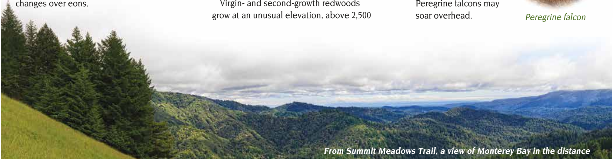
From Summit Meadows Trail, a view of Monterey Bay in the distance