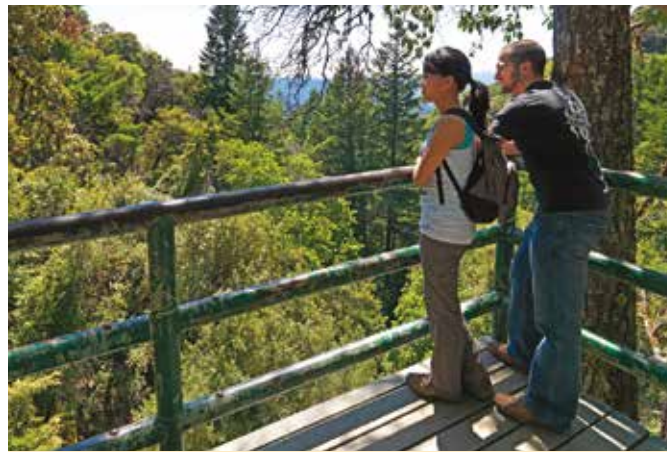
Observation deck at Castle Rock Falls

These complex patterns form with repeated exposure to erosion from blowing sand, water, and chemical and physical changes over eons.