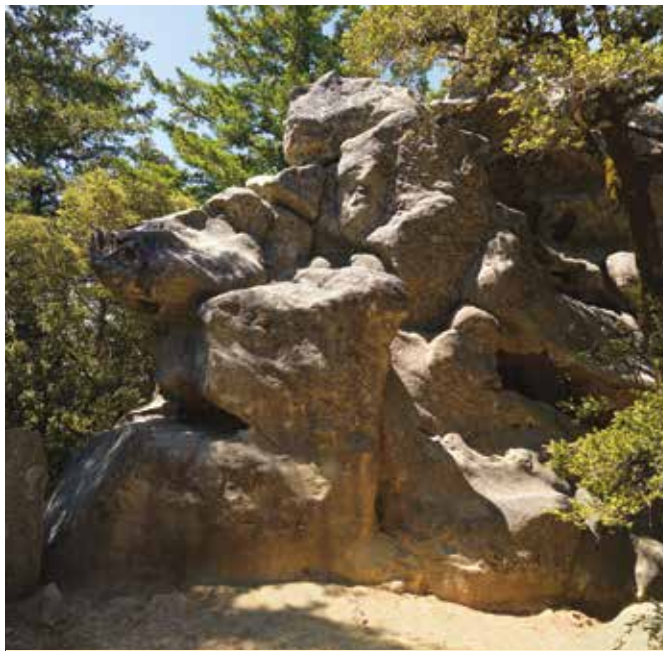
Castle Rock—one of many sandstone outcrops in the park

Native people hunted deer, pronghorns, and bears that were attracted to the area's abundant vegetation. Today's park lies within a major trail system that was used to move resources inland from the coast.